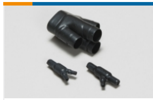
Cable Transitions & Breakouts(3)