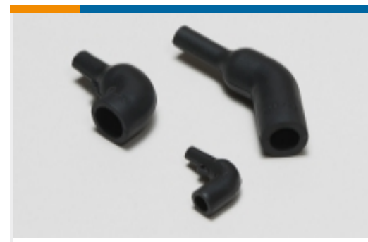
Heat Shrink Boots(2)