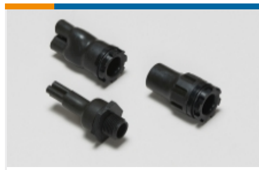
Cable Entry Seals(30)